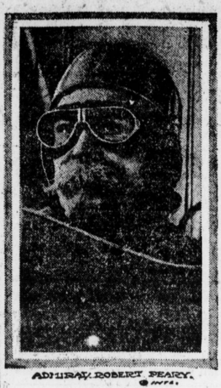
ADMIRAL ROBERT PEARY

Admiral Robert E. Peary, discoverer of the North Pole, in a recent address at Washington, predicted that the explorations of the future in the north and south polar regions and other unexplored regions of the globe will be accomplished with the aid of airplanes. This photo was taken recently in Washington prior to a flight made by Admiral Peary in a naval seaplane.