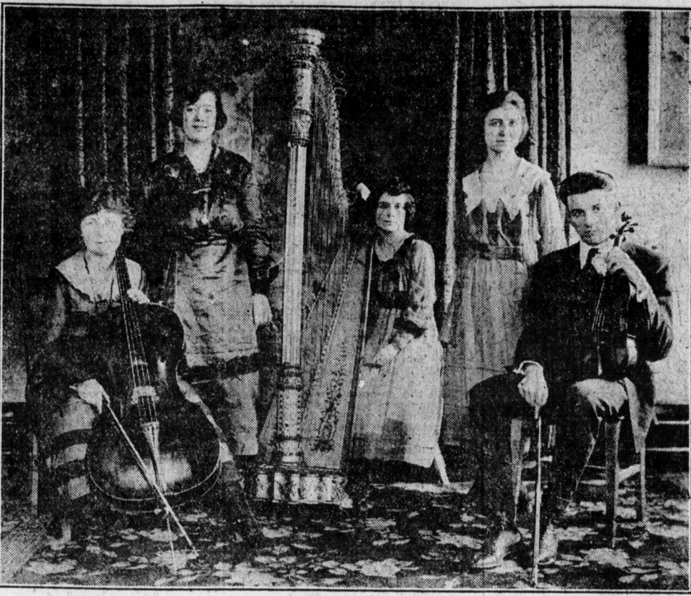
The concerts rendered by the above company of local artists have been so well received that they are preparing to stage another at Carlisle within the near future.