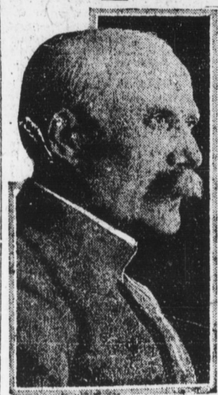
GENERAL HENRI PETAIN MARSHAL OF FRANCE

Just before the French armies were to enter Metz, General Henri Philippe Petain, commander in chief, became the third marshal of France.