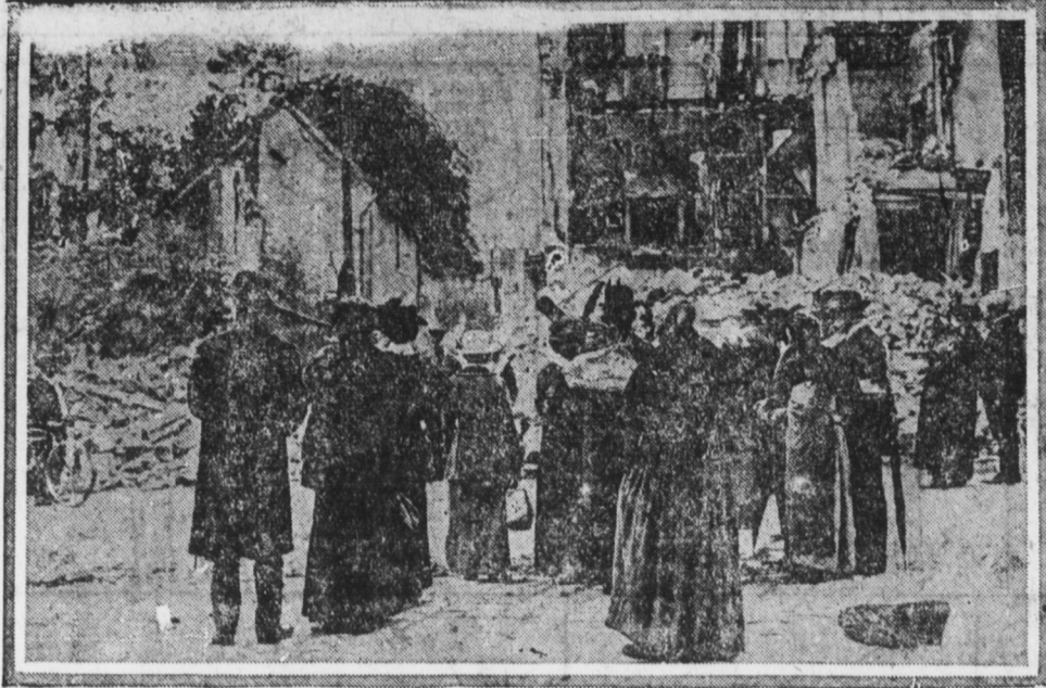
A ruined street in the French town of Senlis, where the armistice, bringing the world war to a close was signed. The town was the scene of much heavy fighting during the great war.