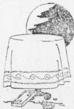
TABLE DAMASK —Mercerized table Damask in a splendid assortment of attractive designs—very fine quality.

Prices are almost as reasonable now as they were last year, in spite of the advance in cost of raw material. The chief sources of supply for flax, from which linen is made, are Russia and Belgium. On account of the European war, the crops for several years have not been available to a normal extent, which has caused a great increase in cost of the finished products, and a great shortage. Better buy NOW at these prices, which are exceptionally low.