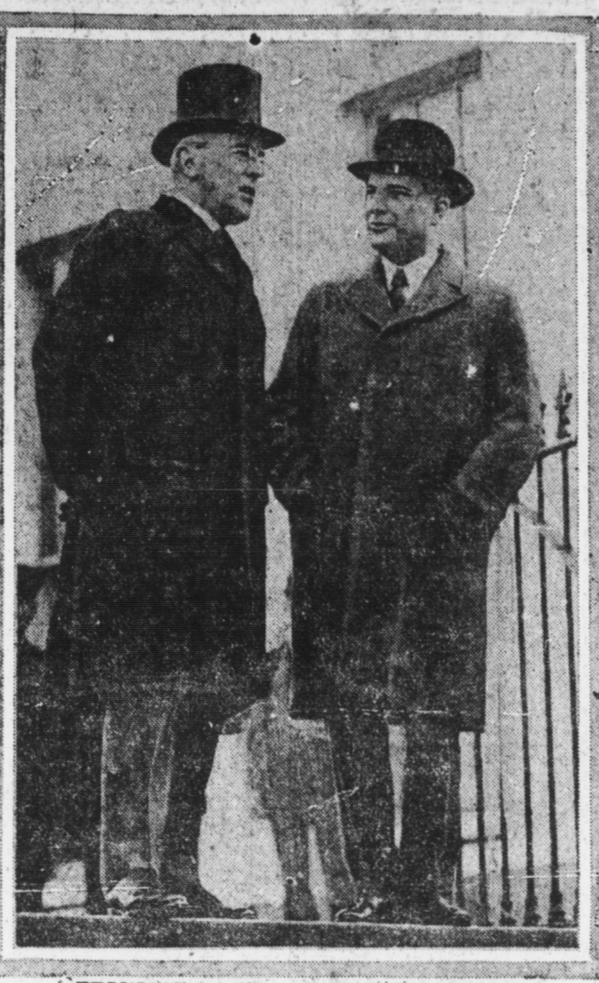
President Wilson, photographed on the steps of the White House on Victory Day, November 11, 1918, while watching the great victory demonstration at the Capital.