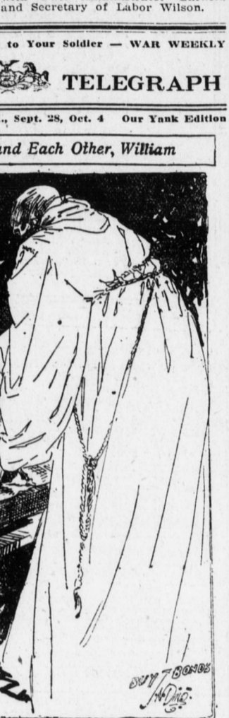
BEST TELEGRAPH WAR CARTOON OF WEEK

Let's Thoroughly Understand Each Other, William