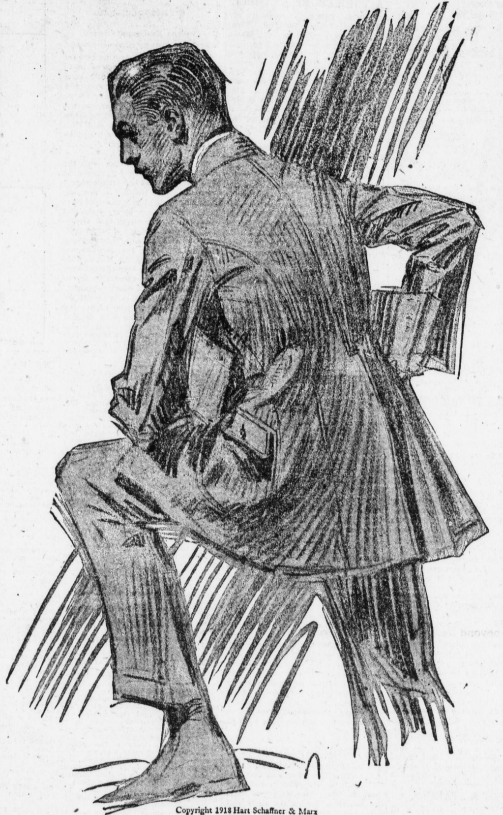
Copyright 1918 Hart Schaffner & Marx

Are one of the ways in which we serve; all wool fabrics, the best of tailoring, the most distinguished style; clothes that you can rely on, absolutely — Such clothes as these, made carefully for service are the best means of saving money for yourself and resources for the country.