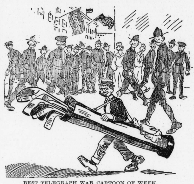
BEST TELEGRAPH WAR CARTOON OF WEEK.