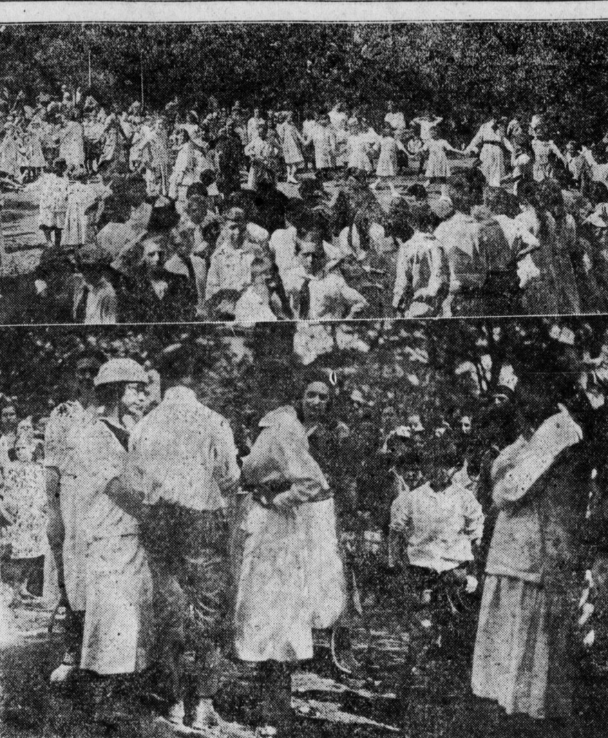
Did the playground hordes enjoy themselves at Reservoir Park to-day? Just look at some views caught by the Telegraph photograph while the boys and girls were in the midst of the Romper Day festivities.