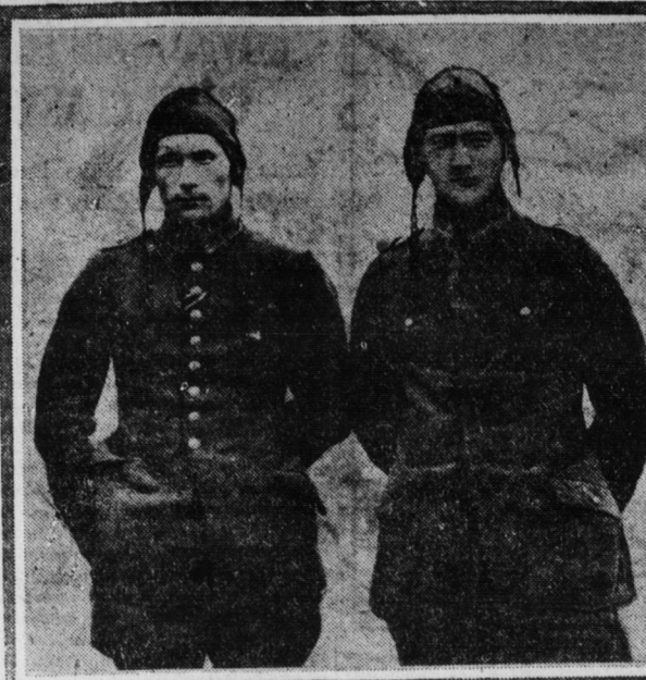
These "Baby Slayers of Berlin" will no longer roam the skies and drop deadly missiles upon the defenseless villagers of France and England and upon hospitals. These German aviators were captured by Allied airmen and are on their way to a concentration camp far from the battling lines.

loss of gasoline, an average of 25.96 miles per gallon. On account of the many changes in prices this year, all cars sold for less than $1,200 are eligible for entry against the Dort, whereas last year the price limit was $1,000 for this class.