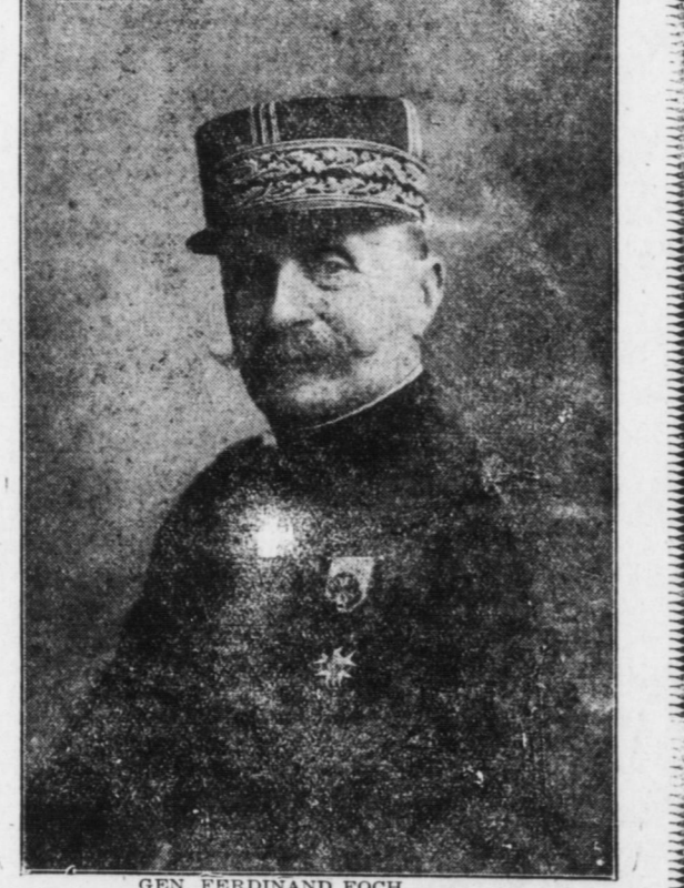
GEN. FERDINAND FOCH Commander-in-Chief of the Allied Armies

are now Fighting with Foch. You cannot know the thrill of battle, but you will certainly want to follow them day by day as they go "over the top" in Picardy and in Flanders, at St. Mihiel and at Toul.