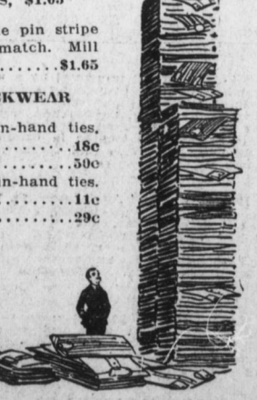
Dives, Pomeroy & Stewart, Men's Store.