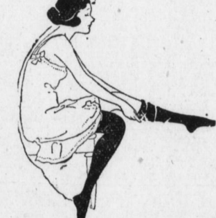
Dives, Pomeroy & Stewart, Street Floor.