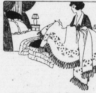
Dives, Pomeroy & Stewart, Street Floor.