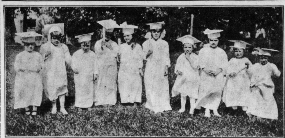
Middletown, June 25.—Above is shown the Cradle Roll children of the Middletown St. Peter's Lutheran Sunday school who have just been transferred to the beginners' section of the school.