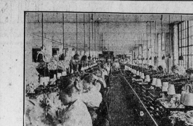
Upper left hand etching, plant where Monito hosiery is made; upper left, corner of recreation and lunch room; below, aisle of knitting room.