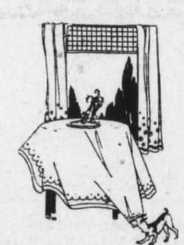
Table Linens That Are Exceedingly Good Value

All linen table Damask-70 inches wide good substantial quality. Yd., $2.00