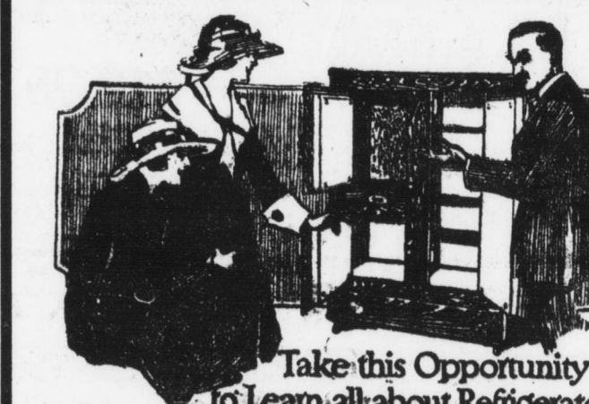
Take this Opportunity to Learn all about Refrigerators

Extra Special Collins Style Shop Extra Special Today and Saturday —Women's $7.50 Rain-coats, Choice $1.98 Sizes 34 to 40