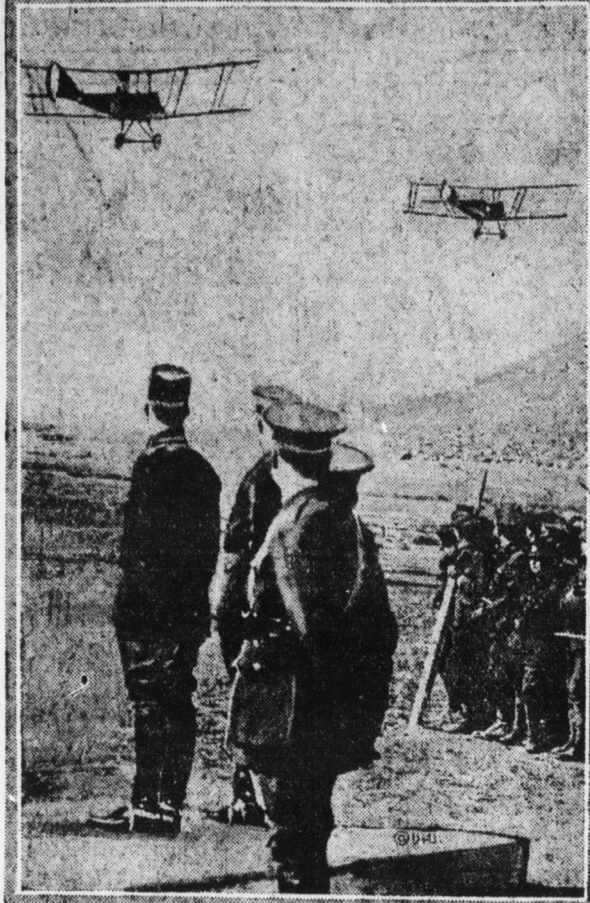
This is the first photograph of King Alexander of Greece to reach the United States, showing him on the British front in Macedonia. The King has been intensely interested in the war, of course, and this photograph shows him watching British airplanes fly toward the Bulgarian lines.