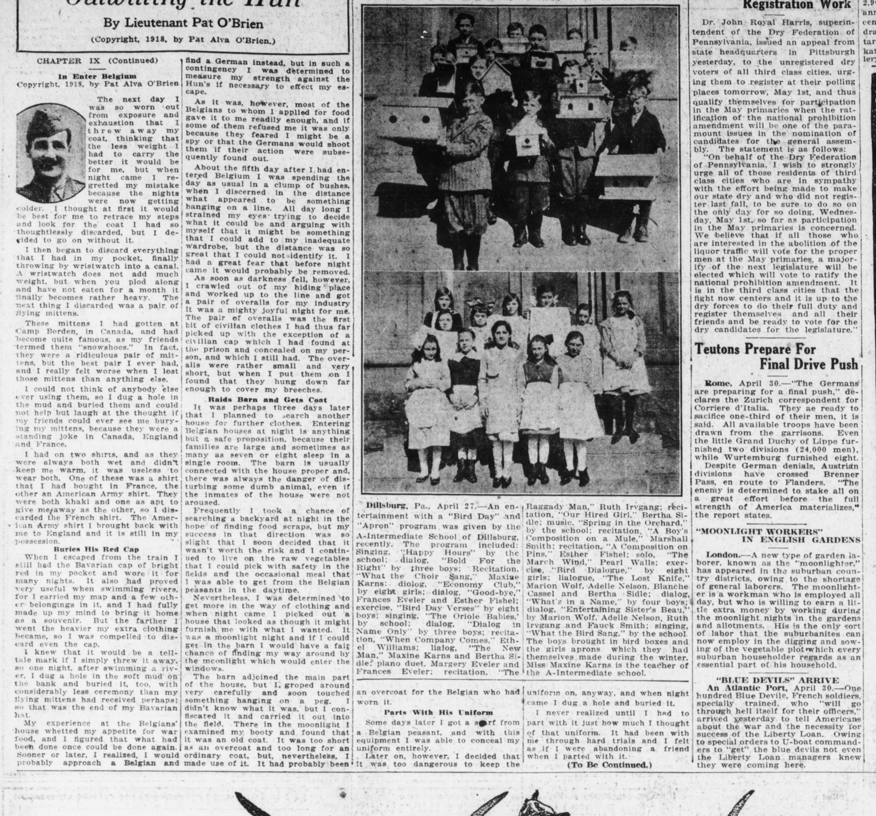
EXHIBIT OF BIRD BOXES AND APRONS