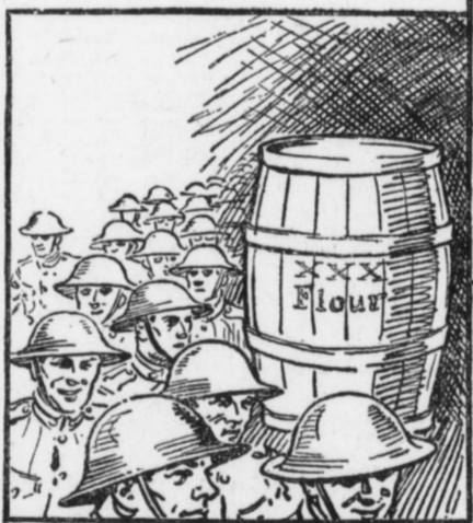
Every barrel of flour saved will make daily bread for 300 soldiers.

You are giving your sons—they are giving their lives—in this fight for the World's Democracy. Will you send them the food so necessary for their health and victory?