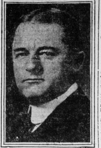
HENRY P. DAVISON.

Henry P. Davison, chairman of the American Red Cross War Council in France, declared in a recent address that the American Red Cross has organized services to take care of the families of the boys at the front, many of whom are worried over the taking care of mortgages and the payment of taxes.