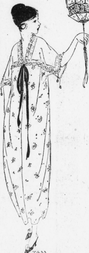
A POPULAR KIMONO.

Because it expresses good taste and features the utmost simplicity, this negligee is sure to enjoy smart favor. It is fashioned of figured rice crepe and attached to a deep shoulder yoke of China silk trimmed with lace insertion and edging. The kimono sleeves are cut in one with the yoke and end just above the elbows with frills of lace and silken tassels. Medium size requires 4 1/2 yards 36-inch crepe and 1 yard silk, with 3 yards of insertion and four of edging. Pictorial Review Negligee-No. 7633. Sizes, 36 to 44 inches bust. Price, 20.