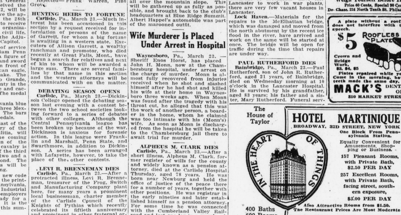
PLATE MACK'S DENTAL

Weigh Yourself Before Taking. Price 60 Cents, Special 90 Cents. Chase. 224 North Tenth St. Philadelphia. P.