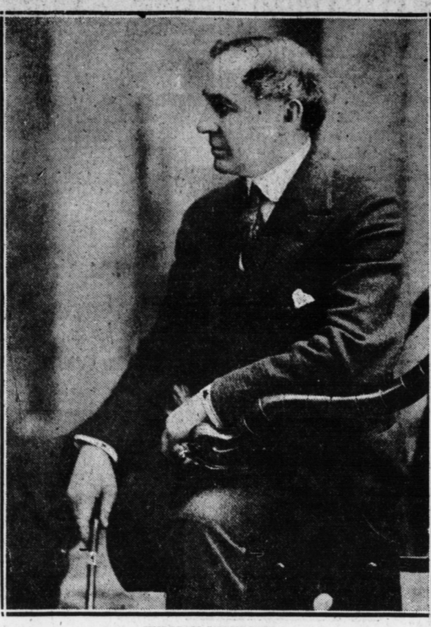
Prominent actor, who plays the name part in the big morality play, "Experience," now at the Orpheum.