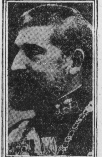
The peace terms submitted to King Ferdinand of Rumania by Count Czernin...