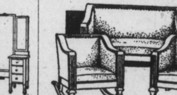
Colonial Style Living Room Suite, Mahogany - Brown Spanish Leather.