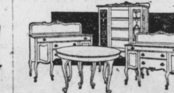
Louis XVI Period, American Walnut and Antique Mahogany.