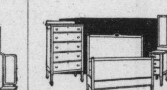
Adam Period, American Walnut.