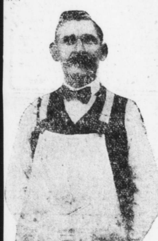
ptured in Right Side

particularly his work. avy timber, jun nd like a vout