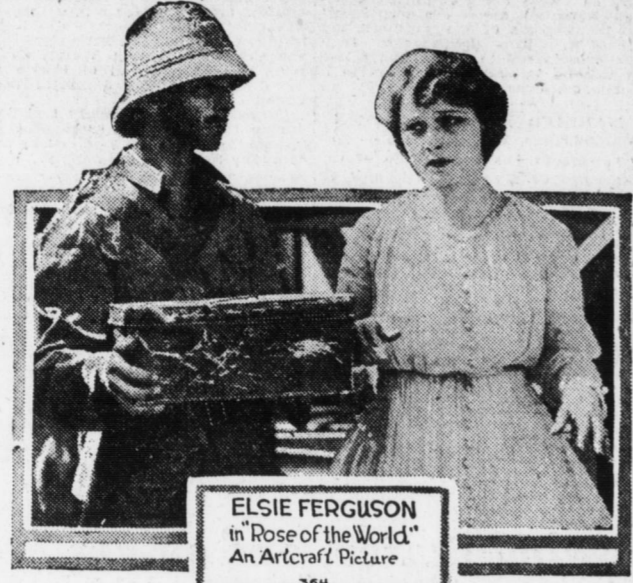
ELSIE FERGUSON in "Rose of the World" An Artcraft Picture

In "Rose of the World," which will be shown at the Regent to-day, to-morrow and Wednesday, Elsie Ferguson interprets a heavy emotional role as the wife of an English army officer during an uprising in India.