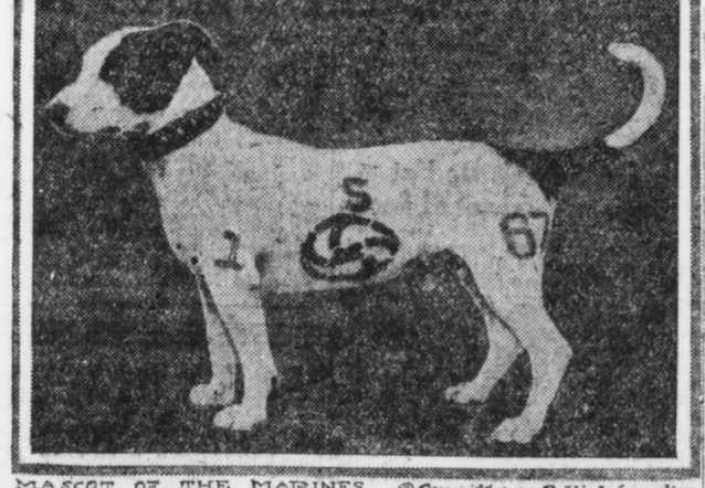
MASCOT OF THE MARINES. Every regiment of "Sammies" has its mascot, and naturally the "soldiers of the sea" must have theirs.