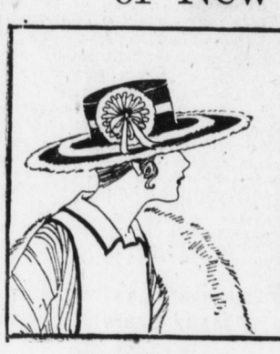
Green and Sand Khaki and Navy Rose and Blue Cerise and Purple Pink caterpillar braid crown and pink faille brim.