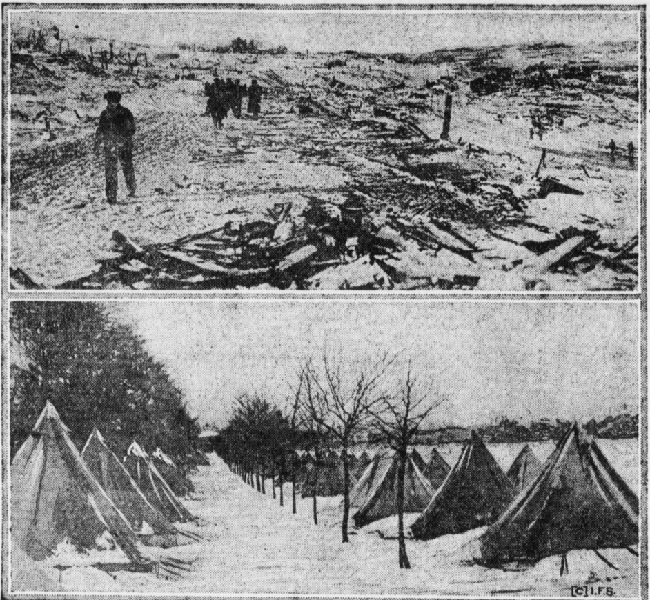
The upper photograph shows the Richmond section of Halifax, where the explosion of the munitions steamer Mont Blanc caused the most damage. There it leveled all buildings toward Dartmouth. The lower picture shows part of the tent city in the snow, where many of the homeless of Halifax are being cared for.