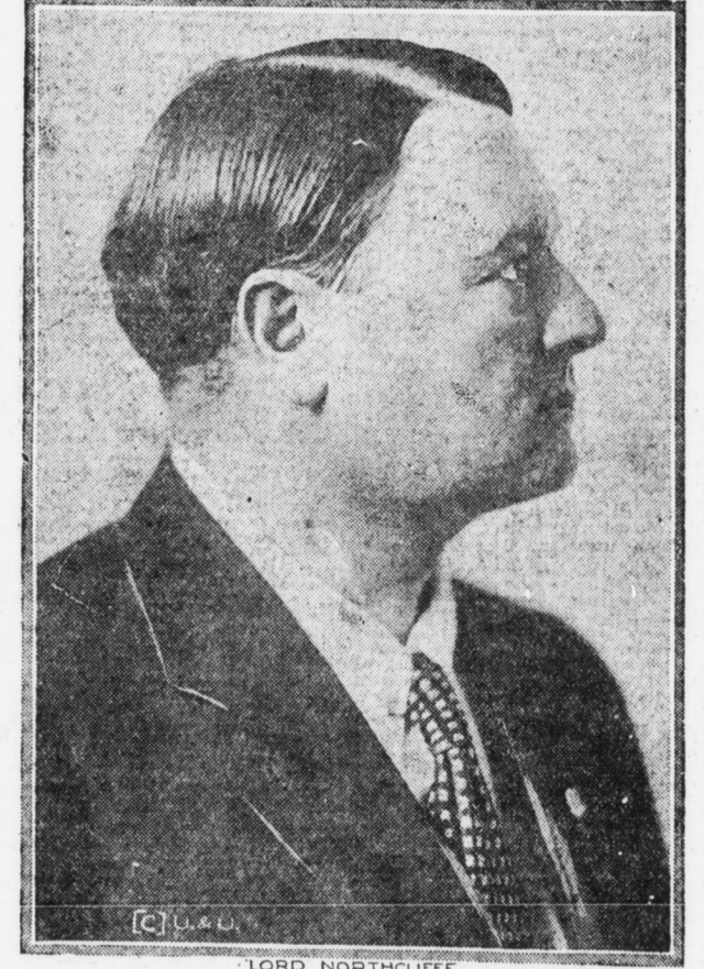
LORD NORTHCLEFFE Lord Northcliffe, who spent several months in the United States in connection with British war work, has been rewarded by being given the title of viscount. Many Britons consider him, despite their dislike of some of his newspapers, as being the ablest man of Great Britain.