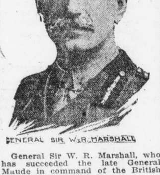
GENERAL SIR W. R. MARSHALL

General Sir W. R. Marshall, who has succeeded the late General Maude in command of the British forces in Mesopotamia.