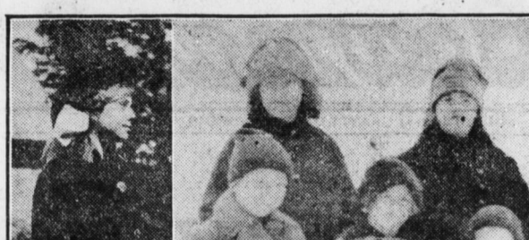
Brotherhood Central Meets; Elects Officers For Year

The Lutheran Brotherhood Central of Harrisburg and vicinity, met in the Zion Lutheran Church, Thursday evening, to make plans for the coming year and elect officers.