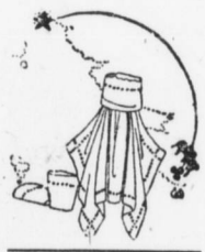
Main Floor, BOWMAN'S---

Lace and net jabots and stocks, 50c to $6.95