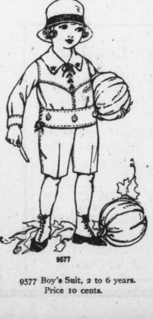
9577 Boy's Suit, 2 to 6 years. Price 10 cents.