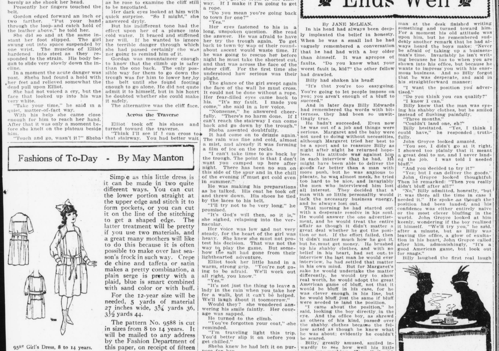
Price 15 cents.

will be mailed to any address by the Fashion Department of