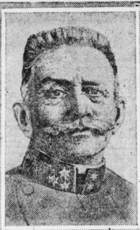
FIELD MARCHAL VON HOETZENDORF Field Marshal Conrad Von Hoetzendorf, who is commanding the new Austro-German drive against the Italian line on the Asiago plateau, in eastern Trentino. The Teutons are said to be using 200,000 men in this new move.