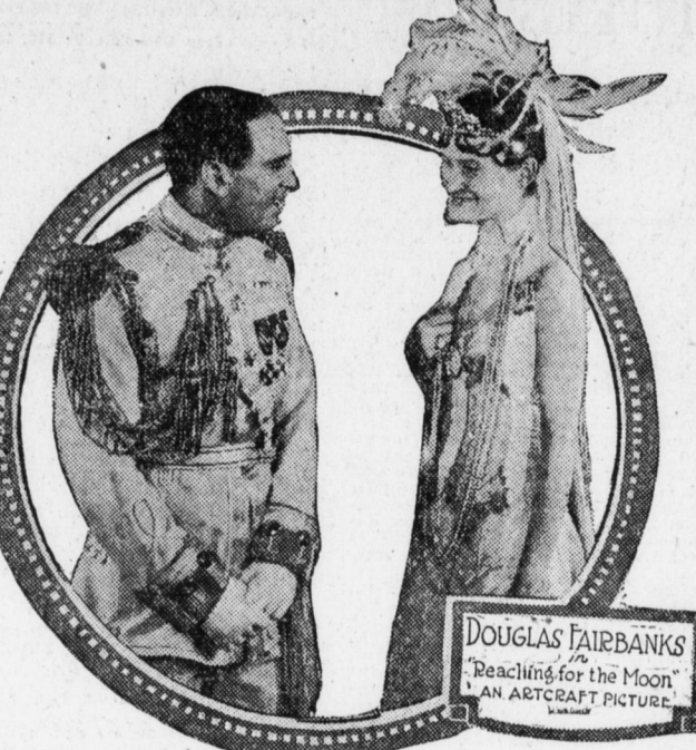
At the Regent Theater to-day, to-morrow and Wednesday, Douglas Fairbanks is appearing in his greatest success, "Reaching for the Moon." It is said to be full of the old Fairbanks humor—"per" status—thrills—full of everything. At frequent intervals during the plot he has plenty of chance to risk his own neck and endanger the necks of others, after the manner his public has come to expect of him.