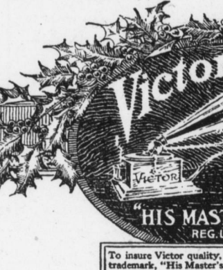
To insure Victor quality, always look for the famous trademark, "His Master's Voice." It is on all genuine products of the Victor Talking Machine Company.