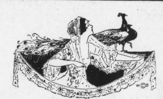
Exhibit and Sale of. Real Italian Filet Lace

ered and self-basting. Size 11x16 inches. Will roast a 12-lb. turkey.