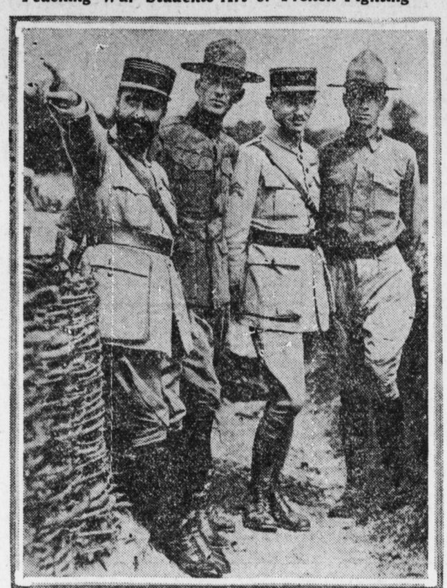
FRENCH INSTRUCTORS AT ST. OGLETHORPE.

Teaching War Students Art of Trench Fighting