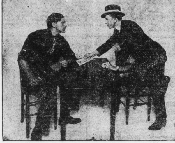
The characters and the situations of "The Girl Without a Chance" are presented without artificiality and in a manner that is perfectly logical, tense and with a good, round measure of warm, human sympathy.