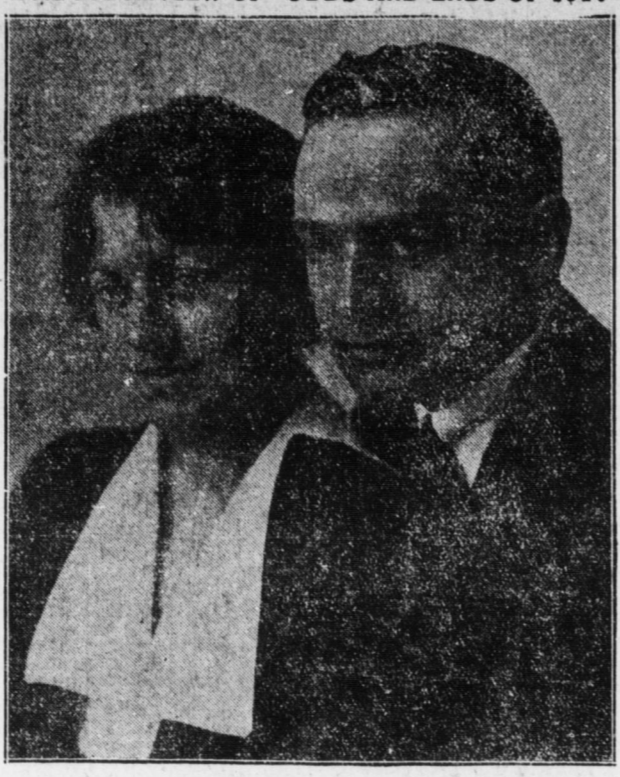
Norworth and Shannon's new musical revue, "Odds and Ends of 1917," will be presented at the Orpheum next Monday evening.