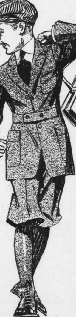
Boys' Belter Suit, $7.50