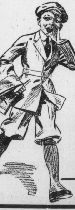
Boys' Two-Pant Suit, $8.50