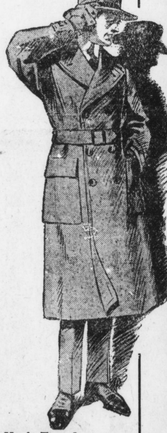
Men's Trench Overcoat, $20