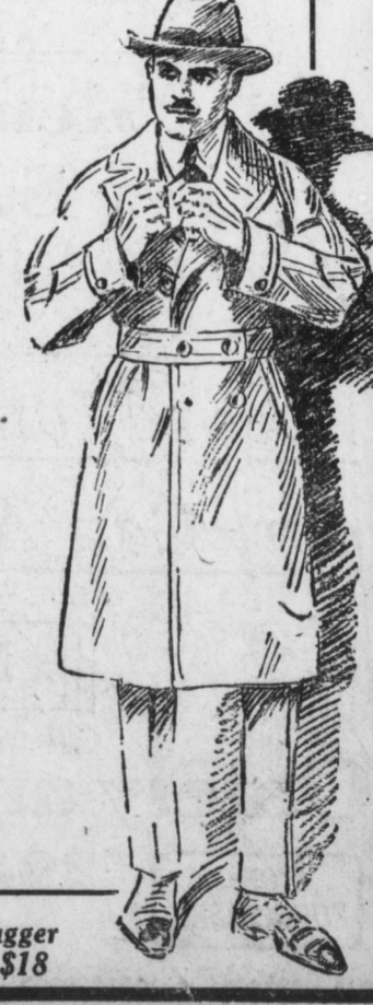
Men's Swagger Overcoat, $18

Boys' Suits, Overcoats, Mackinaws Juvenile Overcoats — ages 2 to 8 years — in Scotch tweeds—$5.00, $6.50, $7.50. Chinchilla Reefers — ages 2 to 10 years — military style—$6.50, $7.50. Boys' Mackinaws — sizes to 18 years— $5.00, $6.50, $7.50 Boys' Trench Overcoats — ages 12 to 18 years — military models with all-round belts and buckles — Beautiful Scotch effects — in tan, gray or mixtures—$7.50, $10.00, $12.50. Boys' Olive Drab Wool Mackinaw Sets — with leggings and hat — ages 2 to 8 years—$6.50. Boys' Olive Drab Mackinaw Coats—sizes 8 to 18 years—$7.50.