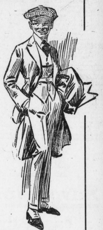
Young Men's Blue Flannel Suit, $20

That's what we showed when we obtained these Suits and Overcoats in New York the other day--- And that's what you will have to show in order to get the pick and choice of the groups ---for at a time like this--- when prices are more apt to go up rather than to go down ---when high grade suits and overcoats can be had at the tempting prices which we are so splendidly equipped to name ---