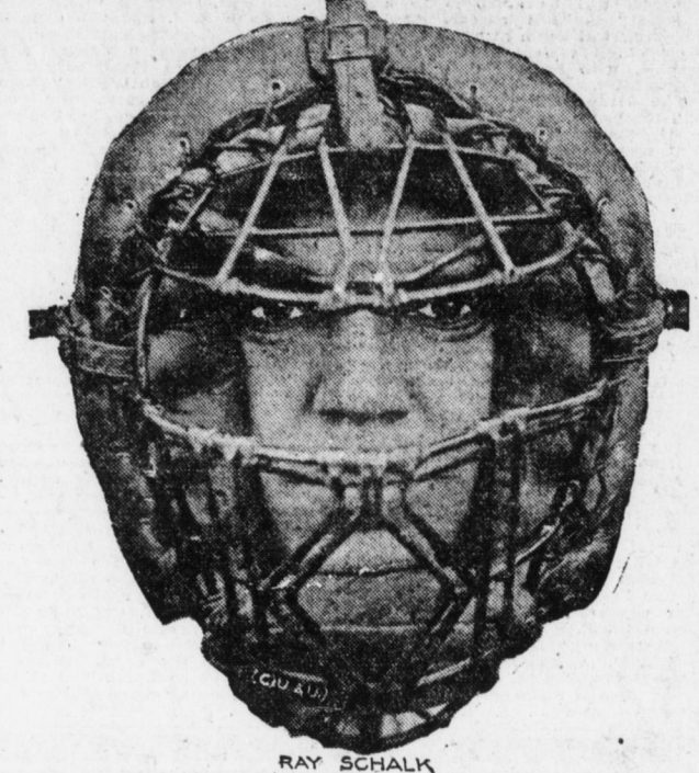
Fans of the National League admit with those of the American League that Ray Schalk, catcher for the White Sox, is the best man in the business. In this department there is no question the White Sox have the advantage over the Giants for the world series. But Schalk is weak in the eyes of the Sox. He averages for the season is only .223. He had his first hit yesterday.