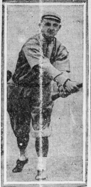
HEINIE GROH. Groh, of the Cincinnati Reds, has a national league batting record, passing Benny Kauff, Groh gathered six hits in six times at bat.