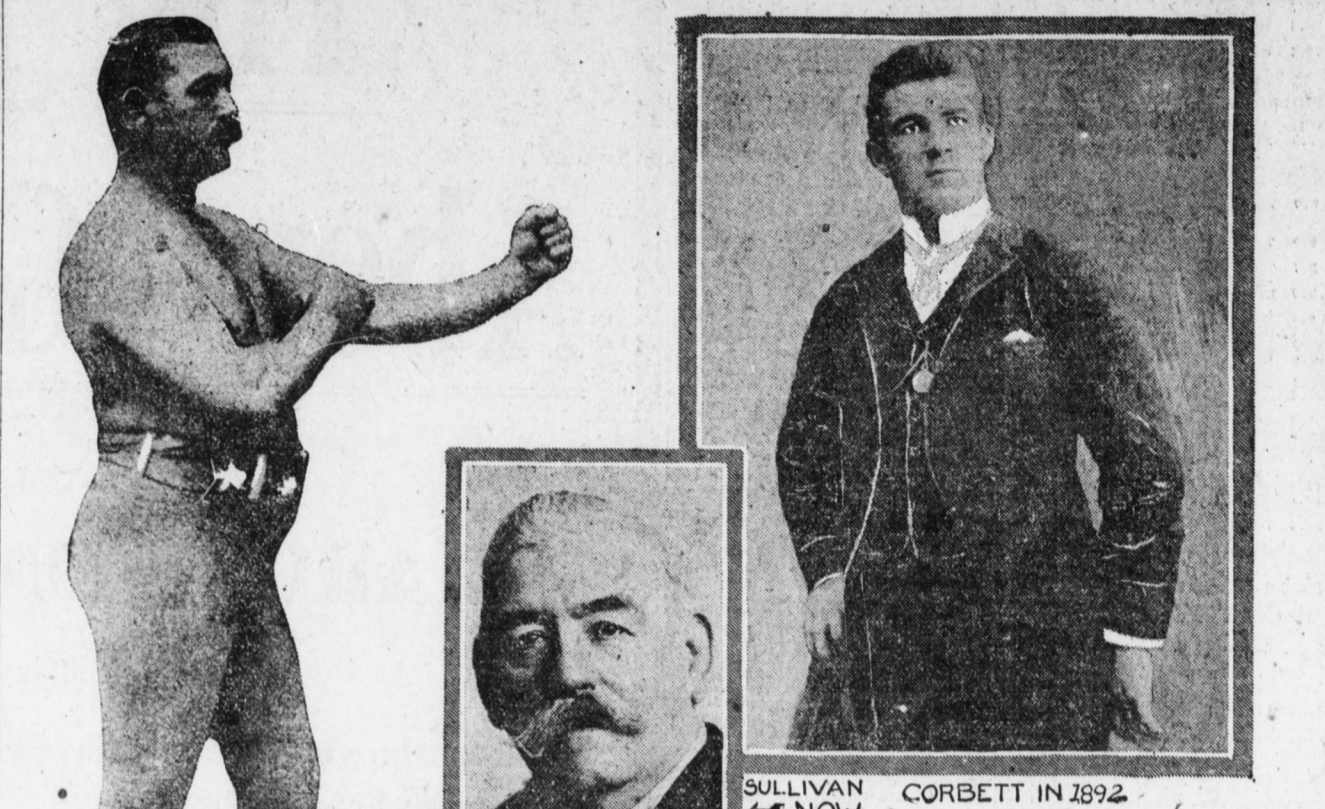
SULLIVAN CORBETT IN 1892

This month marks the anniversary of the greatest heavyweight championship fight ever staged in America for the world's title. The champion, the conqueror of that memorable battle in New Orleans, James J. Corbett, "Pompadour," or "Gentleman Jim," as he was then called, delivered a dissertation on the event September 7, the anniversary day.