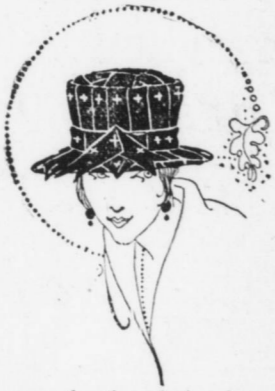
Exhibit in the newly enlarged millinery section on the third floor.

—Also showing the new feather brim hats which will be exceedingly modish for the new season—together with a delightful display of chic velour hats in the rich bright colorings.