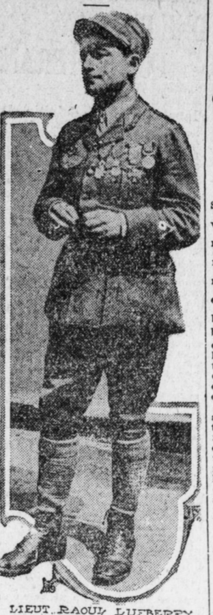
LIEUT. RAOUL LUFBERY