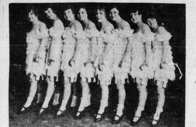
Here are eight members of the Garfield Musical Comedy Company as they will appear in "The Beggar Prince" at the Paxtang Park Theater the first half of this week.

PAXTANG PARK—Vaudeville, COLONIAL—"The Eternal Sin," REGENT—"Builders of Castles."